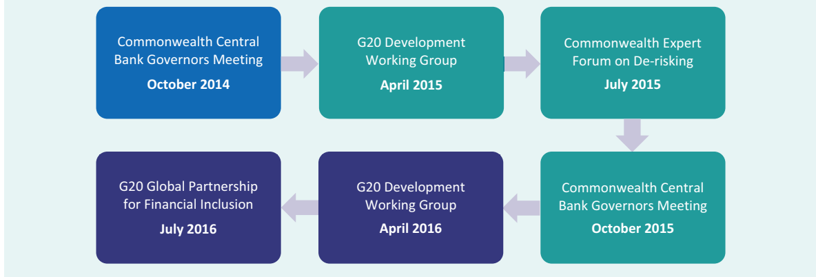
Figure 1 Background to Commonwealth engagement on de-risking